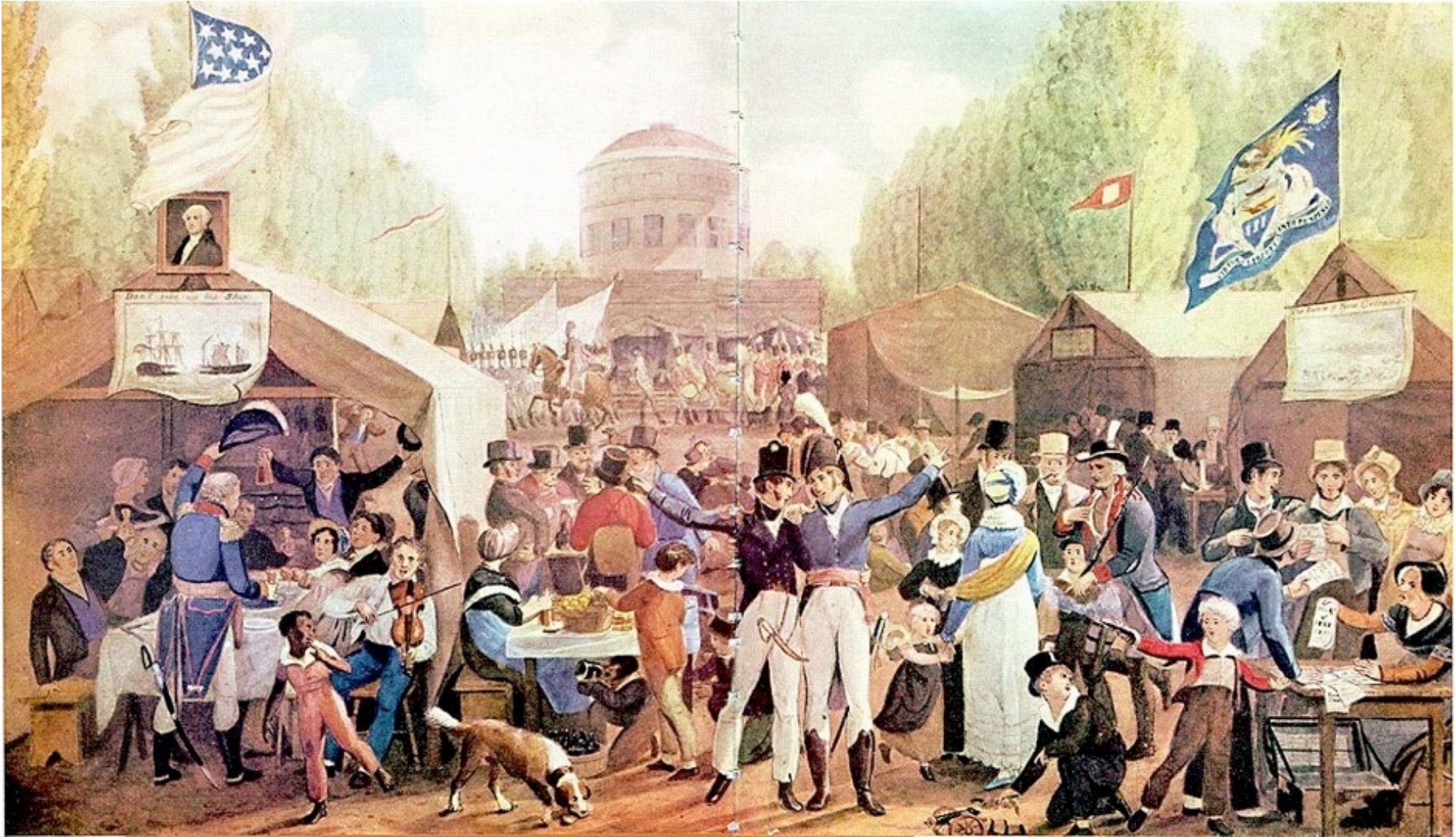
“Fourth of July” 1819 by John Lewis Krimmel

By 1819, the year in which Krimmel exhibited Fourth of July Celebration in Centre Square, the event had become a large celebration where people gathered in the square facing Independence Hall. The 1819 painting depicts a festive crowd of soldiers, merchants and citizens, assembled at tables and under tents.