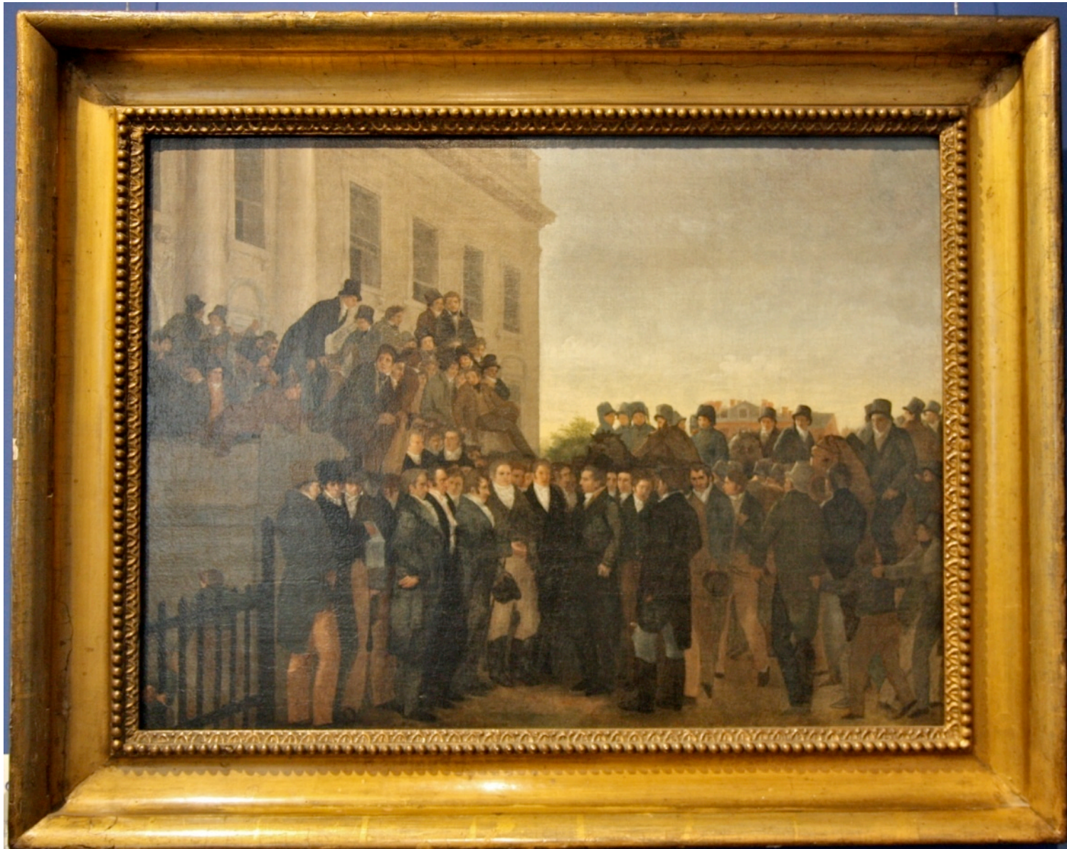
"Return of Monroe to Washington from a Northern Excursion, 1817" by Pietro Bonanni

The setting of this painting is the north facade of the President's House. James Monroe is the tall figure in the center of the painting at the base of the steps. The group of people around him are "well wishers" gathered to greet the president on his return from his tour of the northern states in 1817.